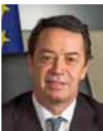
Manuel Pinho Minister for Economy & Innovation, Portugal

Ruud Lubbers has been the longest serving prime minister of Netherlands from 1982 to 1994, who until taking up the post of UN High Commissioner for Refugees taught Globalisation Studies at the John F Kennedy School of Government at the Harvard University. As Prime Minister he was the father of Netherlands privatization and deregulation programmes. He is currently the Chairman of the Board of Netherlands' Energy Research Centre in the rank of the Minister of State.