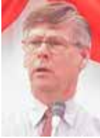
Ola Ullsten Former Prime Minister of Sweden

Ola Ullsten has made a tremendous contribution to the environmental improvement and ecology. He was recognized for his contribution with an honorary degree at the University of Guelph in Canada in 1999. He is presently Co-Chair of the world Commission on Forests and Sustainable development. Dr. Ullsten was a member of the Swedish parliament from 1964 to 1982, and served simultaneously as the Minister for International Development cooperation from 1976-78 and as Minister of Immigration (1977-78), then as Minister of Foreign Affairs (1979-1982). He was elected leader of the Swedish Liberal Party (1978-82) and later the same year became the Prime Minister. Dr. Ullsten is the Chair of the OAC International Advisory Council, a senior fellow at the International Institute for Sustainable Development in Winnipeg and a member of the Board of Directors of the Woods Hole Research Center, Massachusetts, USA