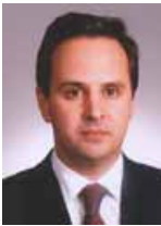
Fernando Medina Maciel Almeida Correia Secretary of State for Employment and Vocational Training of the Portuguese Government

Sir John was elected to the House of Assembly of Papua New Guinea in 1972 and became a member of its Constitutional Planning Committee. In 1995 he was elected President of African, Caribbean and Pacific Group of States group of states and co-president of the ACP-EU Joint Assembly. He was a Governor of the Bank of Papua New Guinea and is currently the Secretary General of ACP Group of States. He was a national champion in the 440 yards and the first black man to play rugby league football in all white competition in 1960. For his services to the PNG government, Sir John received Queen's awards as Commander of the Order of St. Michael and St. George in 1983 and as Knight Bachelor of the British Empire in 1997.