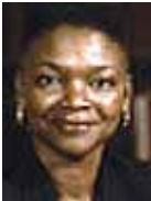
The Rt Hon Baroness Amos of Brondesbury Leader of the House of Lords and Lord President of the Council

Ola Ullsten has made a tremendous contribution to the environmental improvement and ecology. He was recognized for his contribution with an honorary degree at the University of Guelph in Canada in 1999. He is presently Co-Chair of the world Commission on Forests and Sustainable development. Dr. Ullsten was a member of the Swedish parliament from 1964 to 1982, and served simultaneously as the Minister for International Development cooperation from 1976-78 and as Minister of Immigration (1977-78), then as Minister of Foreign Affairs (1979-1982). He was elected leader of the Swedish Liberal Party (1978-82) and later the same year became the Prime Minister. Dr. Ullsten is the Chair of the OAC International Advisory Council, a senior fellow at the International Institute for Sustainable Development in Winnipeg and a member of the Board of Directors of the Woods Hole Research Center, Massachusetts, USA