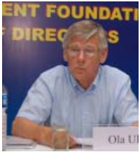
Ola Ullsten Ex- Prime Minister of Sweden