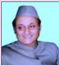
Dr Karan Singh Member of Parliament