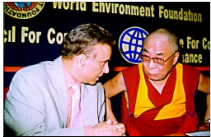
Ola Ullsten Former Prime Minister of Sweden and Chairman, World Council For Corporate Governance

"The forests are gone, the soil is eroding, the rivers have dried out, poverty spreads and with it political instability. And I agree with my old friend and former colleague Hans Blix, when he suggests that the deterioration of the world's environment is a more serious threat to mankind than is international terrorism. And may I add; there is connection between the two."