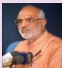
Dr Sahib Singh Former Labour Minister Government of India