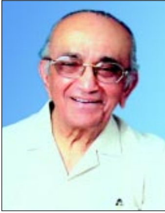
Justice P.N. Bhagwati Former Chief Justice of India Member, UN Human Rights Committee Chancellor, Hyderabad University Chancellor, Lal Bahadur Shastri Sanskrit Vidyapeeth

Chairman, Centre for Social Responsibility