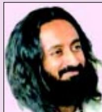
H H Sri Sri Ravi Shanker Art of Living