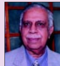
Justice M N Venkatchaliah Former Chief Justice of India