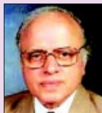
Dr M S Swaminathan Chairman National Commission of Farmers