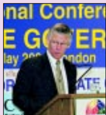
Dr Ola Ullsten Former Prime Minister of Sweden